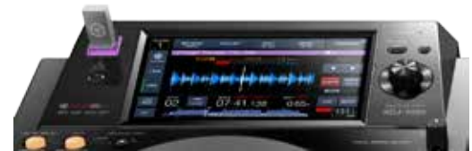
7-INCH TOUCHSCREEN DISPLAY