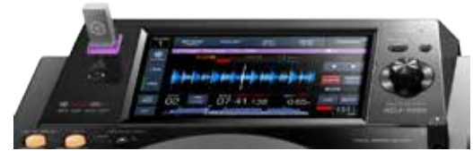
7-INCH TOUCHSCREEN DISPLAY